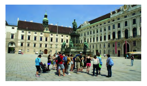
Small Group Walking Tour- Vienna / optional activity not included in the tour

Join us for the perfect introduction to Austria's fascinating capital city, on this fun and informative walk through Old Vienna. There are so many unique attractions, world-famous museums and historic monuments to see in Vienna. Your expert guide will tell you lots of interesting facts and anecdotes about the food, people, culture and architecture along the way. Besides the many places you'll discover, your guide will give great advice on places to visit afterward, including the locations of bars, restaurants, and some of the city's legendary cafés.